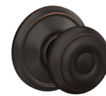
Aged Bronze Hardware