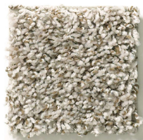
Natural Ivory Carpet