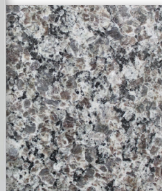
New Caledonia Granite