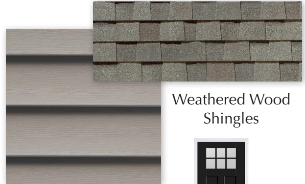
Granite Gray Siding