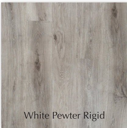
White Pewter Rigid