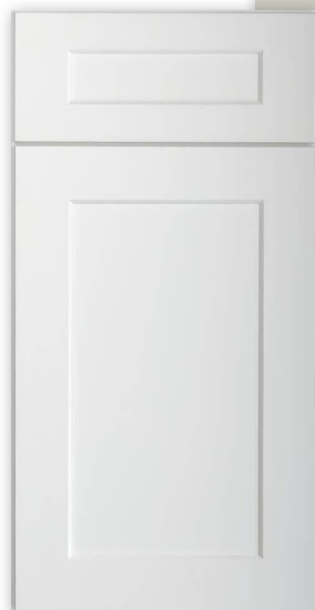
Roma White Cabinets