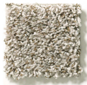
Natural Ivory Carpet