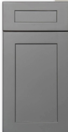
Roma Grey Cabinets