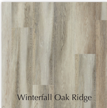
Winterfall Oak Ridge