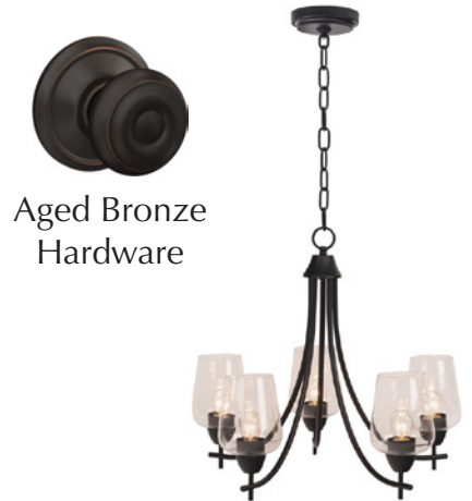
Aged Bronze Hardware